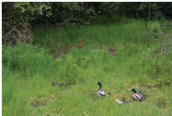
Halstead 21st Century Group 2016

Whilst there would be plenty of information boards around the site the Reception and Learning Centre located within the surviving above ground shelter would provide more structured information and learning resources.