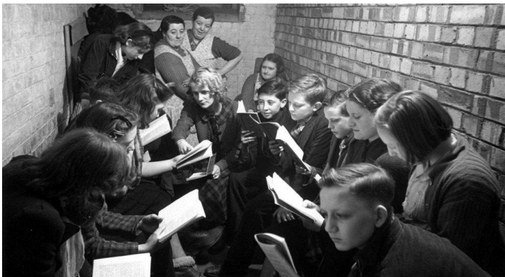
School lessons continue down the shelter, circa 1940. Location unknown but similar to the above ground shelter that survives on site.

With the shelters part of the Courtaulds legacy and Halstead's Heritage, this area is the ideal setting for celebrating the history of Halstead and using the structures for the benefit of the present day community and preserving them for future generations.