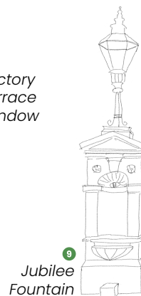
9 Jubilee Fountain