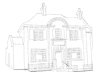
7 31 High Street