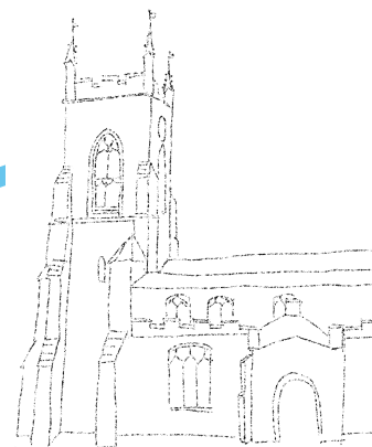
8 St Andrew's Church